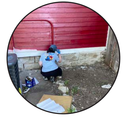
Above : A volunteer paints the outside of one of the LUL! homes.