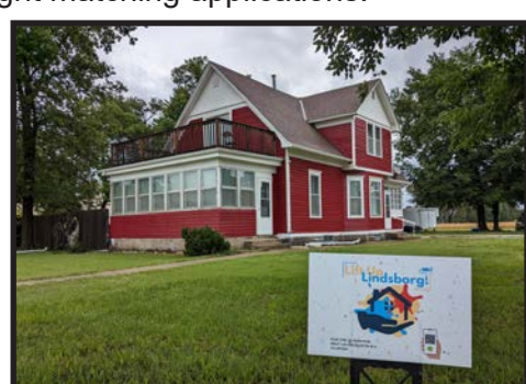
Above: The before/after of a LUL! home from June 2023.